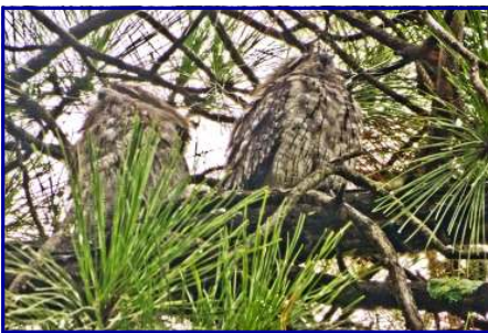
Two Tawny Frogmouths at Grange Forest Park (4 March 2012)

(State of the Brook continued from page 2)