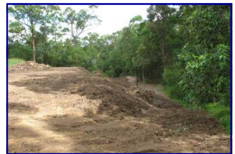
Wahminda Grove-Powerlink Project area after clearing

period should have advance information prepared so that at least the home page will continue to flag these activities well.