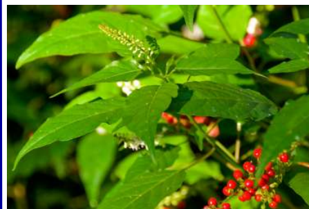
Coralberry ( Rivinia humilis )

Also called Baby Pepper, Coralberry is not a declared plant under Queensland or BCC legislation, but is often found in coastal districts in damp shady areas, native rainforest margins or waste spaces. It interferes with the re-establishment of native plants after the habitat is disturbed.