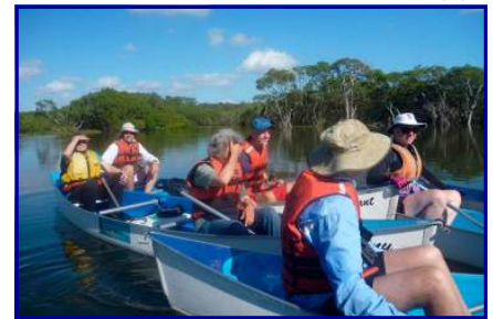
Canoeists exploring Jackson Creek