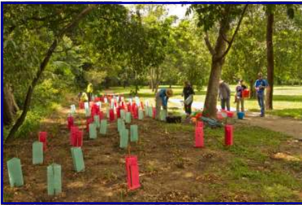
Stage 2 area planting at Bob Cassimaty Park

I shall be visiting Africa where the pressures of population and turmoil are far sharper than here in Australia, and perhaps can bring you back some comparisons that will provide us with lessons and challenges for action in our