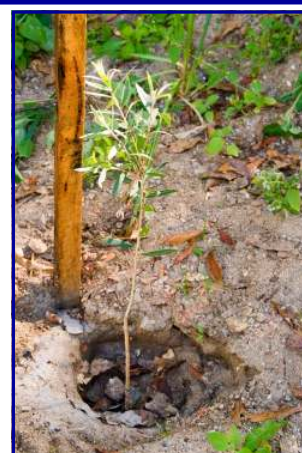
A flood, two months after the planting of this long-stem plant, did not rip out this plant as would be expected with the traditional shorter stemmed plant. Although this plant still needs re-topping up of top soil, it is still growing and healthy.