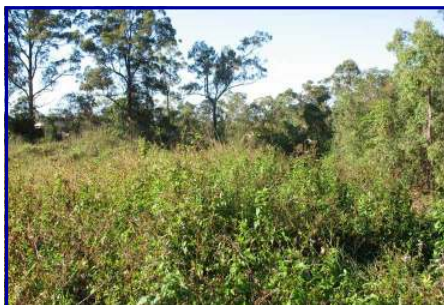
Wahminda Grove-Powerlink Project area before clearing