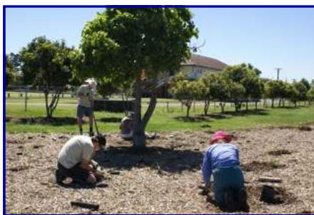
Melrose Creek Bushcare Group planting on 17 October 2010

have been away. The sites are powering on with all of the rain we have had which is a dramatic change from when I went on leave and we were experiencing drought. But the wet weather also brings a few challenges and keeping up with the rapid growth of weeds in the wet season is a huge challenge for many of the bushcare groups.