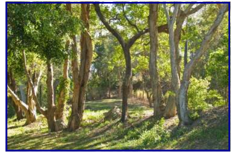
Sunny morning near Keith Boden Wetlands, Cressey St., Nundah