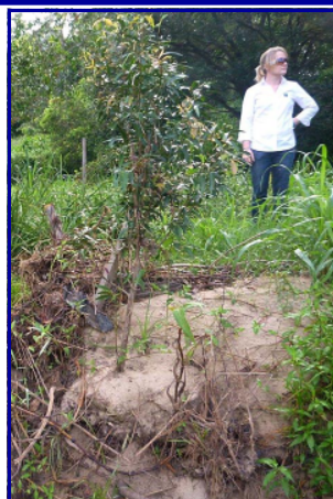
Undercutting of roots by flooding with tree planted close to drop in bank (RS-W)

procedures for Long Stem planting visit: http://www.australianplants.org/Long%20Stem%20Guide/LStem%20Planting%20Guide.htm