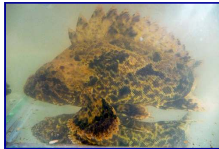
Bullrout ( Notesthes robusta ) observed at the Kalinga Park Fish Snapshot, 12 March