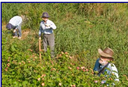
Walls of weeds menace the Tuesday Tree Liberators at Pony Club Bend