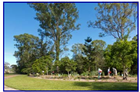
Early morning planting in habitat enhancement project at Bob Cassimaty Picnic Ground on 21 January

It's a pleasure to observe the number of families with children at our plantings are on the increase. (CI)