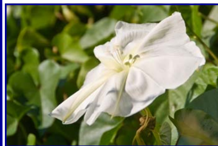
Moon flower (Ipomoea alba)

Moon Flower completely dominates all vegetation along the immediate banks of the brook, for at least 500 m or so, north of Mercer Park, Kedron, near Keith Boden Constructed Wetlands.