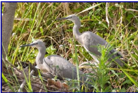
Two juvenile Pale-faced Herons at Grinstead Park

(Bushcare along catchment continued from page 3)