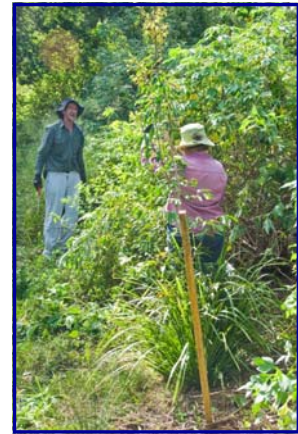
Members of Tuesday Tree Liberators insert trees, shrubs and grasses at intervals along the banks of Japanese Sunflowers and various twiners

The Airport Link project that has affected the Brook so drastically over the last couple of years is going into finishing off mode with major above ground construction infrastructure giving way to landscaping and signage. We have yet to