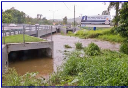
Cedar Creek in flood under Samford Road, Ferny Grove, 25 January

Photos on the Courier Mail web site showed the usual high water levels in Kedron Brook at Lutwyche and amongst the Airway Link construction equipment at Toombul. One photo by Josh Woning indicated the walkway over the Brook from Leslie Patrick Park at Arana Hills would have suffered the usual physical erosion and damage. (CI)