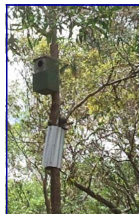
Nest box at Grange forest Park

19, April 2003 'Nest boxes for wildlife' and the current Note A2 'Nest boxes'. Find it on internet using 'Land for wildlife notes habitat trees' in the Google search field. (Jacinta Hamilton)