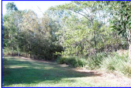
Morning sunshine melting away the shadows at Zion Hill site. Consistent work over the years produces nice returns.

So tell them what makes you happy or proud, desperate or disappointed about the state of your local environment. Also remind them we are all part of the same system; polluting or