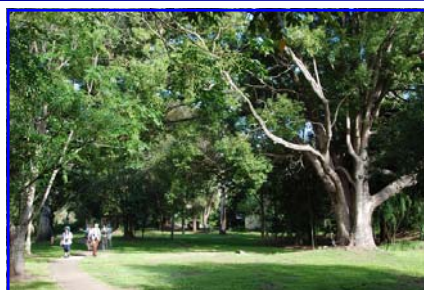
Bird Survey Group observing birdlife in Kalinga Park, Jan. 2008

Now, a further series of surveys are being planned on the mornings of particular Sundays and Mondays through the next few months.