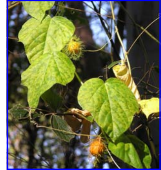
Stinking passion flower (Passiflora foetida)

Another climber with stems up to 4 m long, with sparse to dense white to yellowish hairs, odd smell. Leaves often with 3-5 pointed lobes, 3-5 cm across.